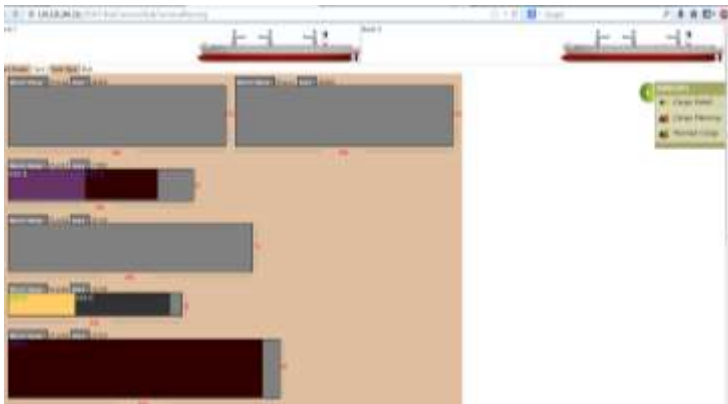
Animated view of cargo planning with data