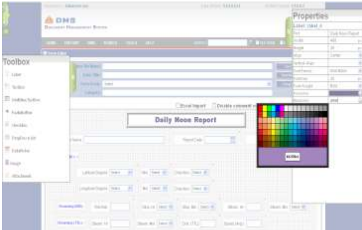
Create / Edit Dynamic forms