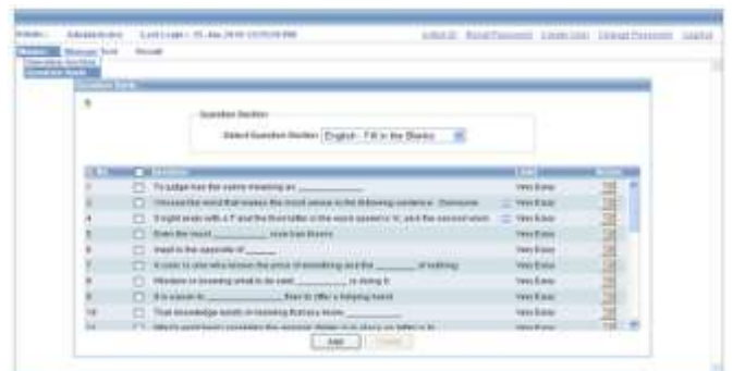
Online test system