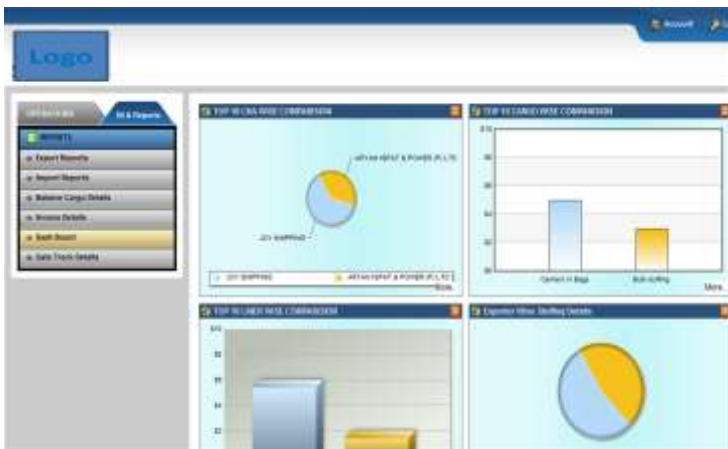
Dashboard – graphical reports